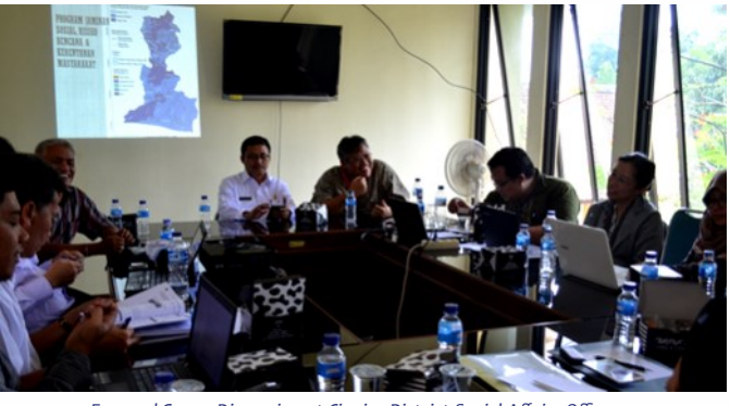
Focused Group Discussion at Cianjur District Social Affairs Office