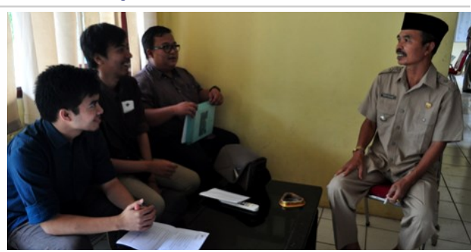
In-depth Interview with Cibinong Subdistrict Head

The assessment showed Cianjur district is facing many challenges imposed from natural hazards, child protection issues and the overlay of these issues. The child protection issues in Cianjur district is in alarming state and increasing along the recent years. Mainstreaming disaster risk reduction and building community resilience in order to fight the impact of the disaster become a necessity in society Cianjur district. This includes counteract the affect of not only natural disasters, but also the social vulnerability embedded in the community. For both issues, the existing social protection system has provided partly a sense of security and contributed to the resilience of children and families. It is partly successful because the high magnitude of social challenges in Cianjur.