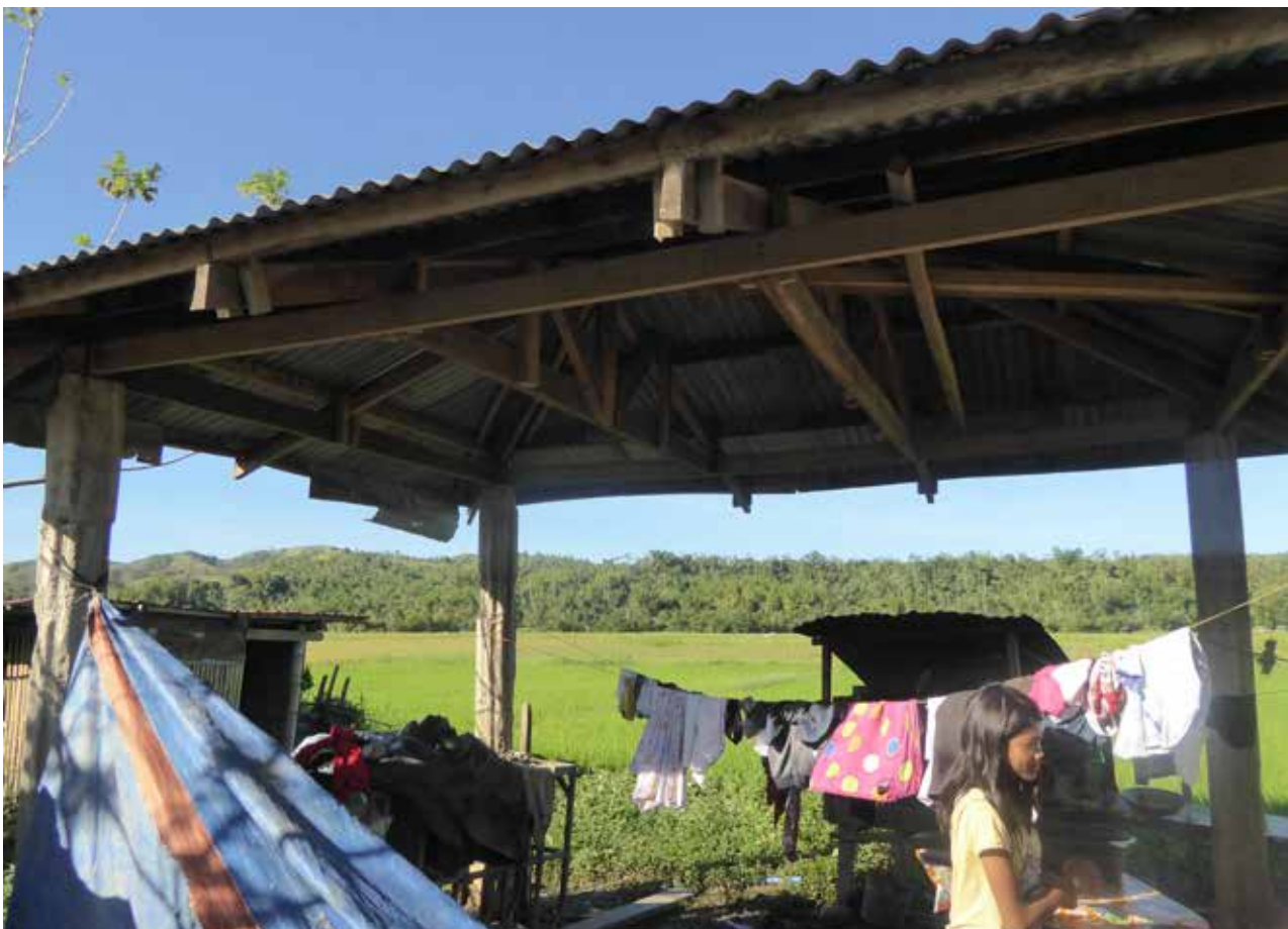
▲ Wilma's house (above) remains unfinished, whereas the elder man (left) was helped by the strong culture of bayanihan in his village

Wilma's CGI sheets are secured well to the roof, but hurricane strapping has not been used anywhere but in the four corners of the roof. We saw the big roll of strapping – given to her with the SRK1 package - rusting in one corner of the garden. When asked why she hadn't use it to strengthen all of the roof connections, Wilma was unable to give us an answer. This was an exception to the majority of barangays and suggests that different implementing partners had more or less capacity to successfully implement and provide the necessary community accompaniment.