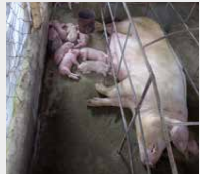
Brenda BARANGAY SUBLANGON, PONTEVEDRA

Could the shelter programme have benefitted from a more sector-integrated approach?