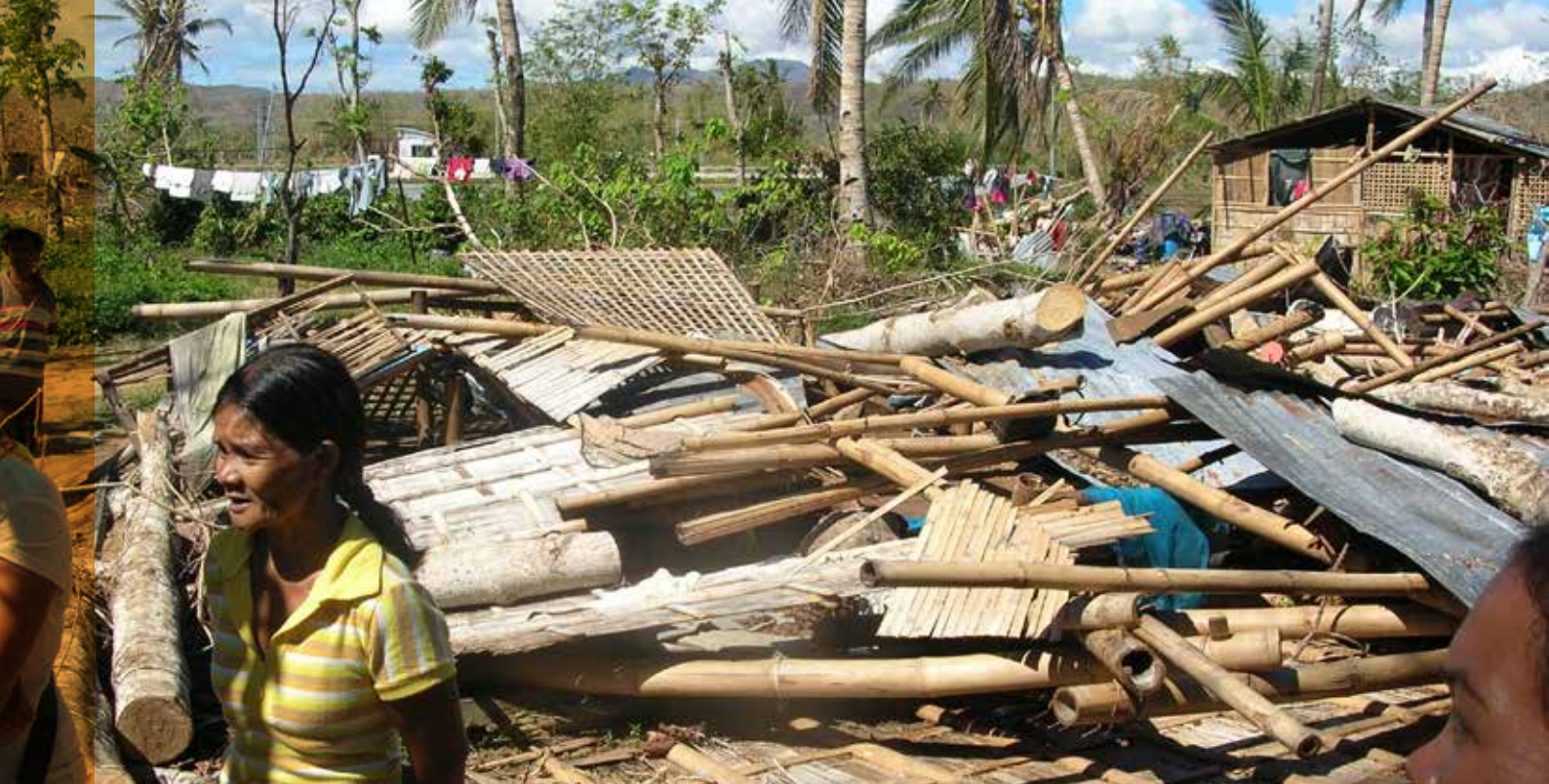
▲ Signs of self-recovery amongst the destruction of Yolanda. This photograph was taken two weeks after the Typhoon made landfall