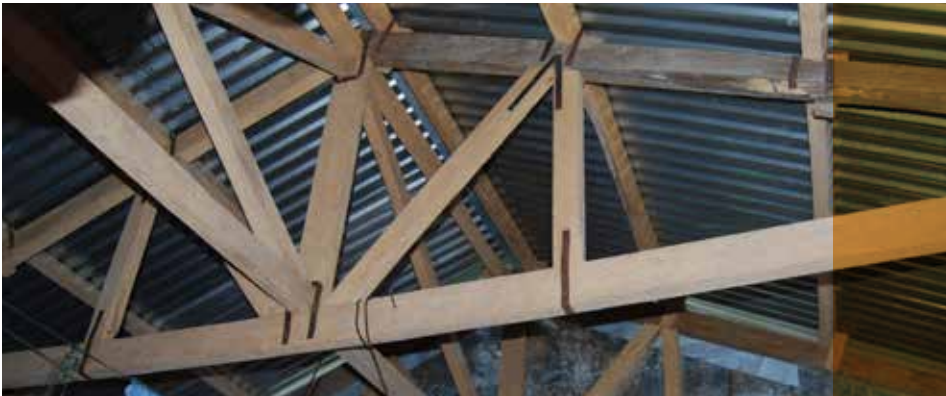
◀ Example of hurricane strapping being used to strengthen connections.

The general construction quality was on the whole high, and occasionally showed a delightful attention to detail.