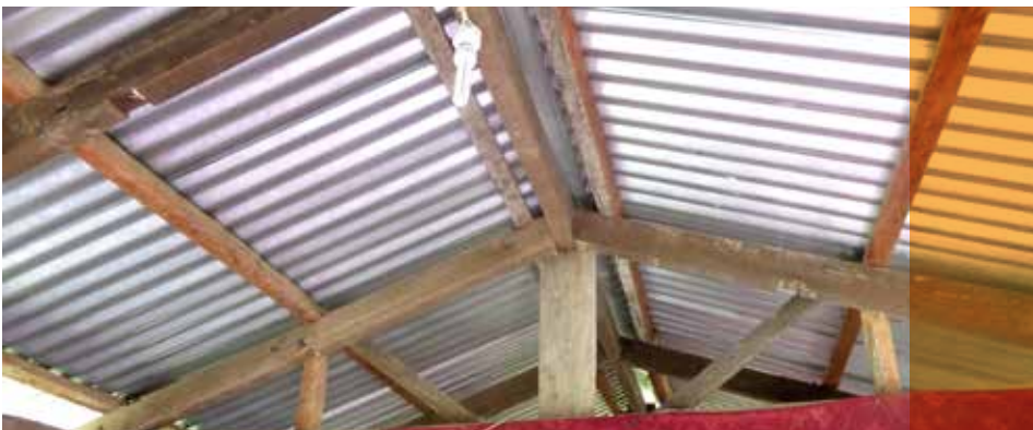
◀ In barangays where the SRK1 package did not include hurricane strapping, nails and tools, BBS compliance was significantly lower than elsewhere and respondents expressed uncertainty when asked whether they consider their new houses to be stronger than their pre-Yolanda ones.