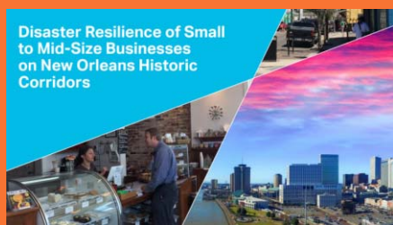
Disaster Resilience of Small to Mid-Size Businesses on New Orleans Historic Corridors

The project builds on the lessons learnt from Hurricane Katrina to improve preparedness and resilience of small businesses in the City of New Orleans. AECOM and the City of New Orleans conducted a comprehensive survey and training of 200+ businesses to enable them to enhance their disaster resilience.