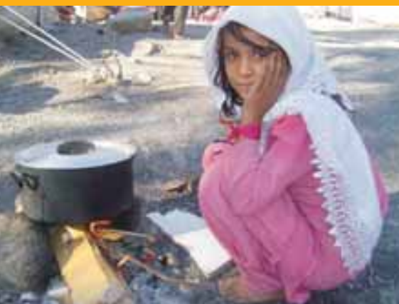
Ray of hope: back to normal life - Balakot