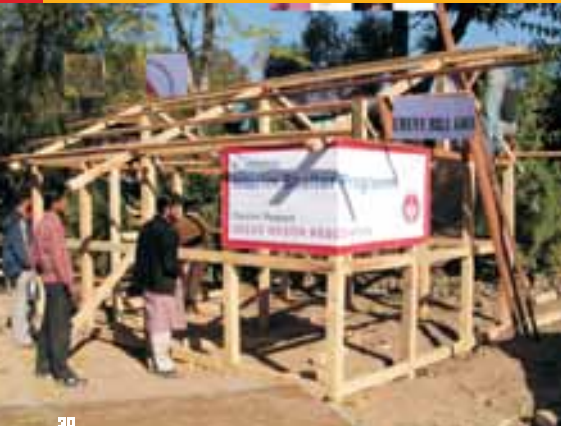
Safe Construction Practices : Interim Shelter in Poonch, Jammu & Kashmir