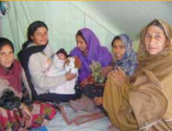
The first baby Boy Born in PATTAN Tent village - Balakot