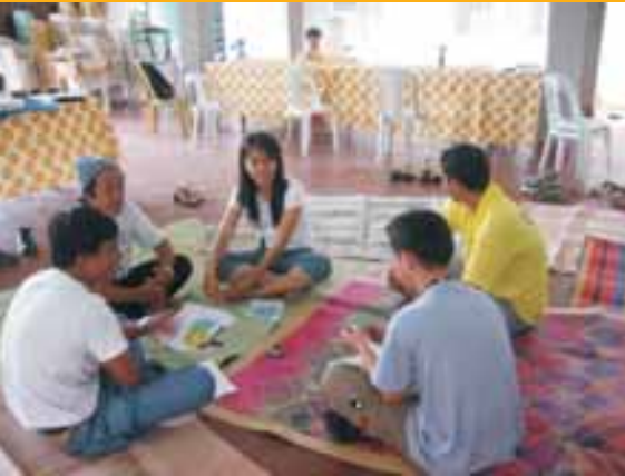
Young NFI workers taking time to discuss their community work