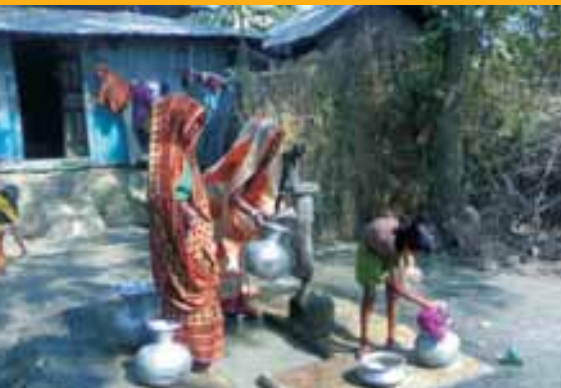
Women have convenient access to safe water