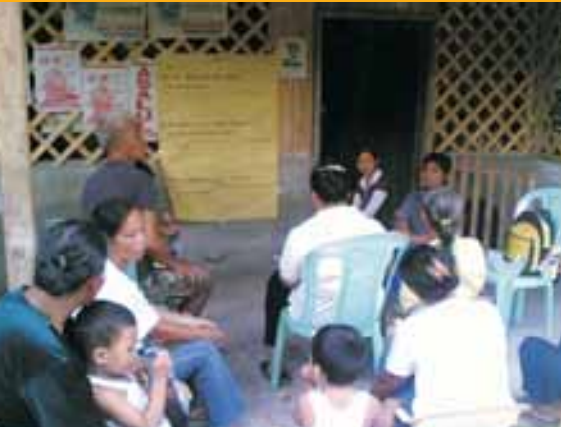
Community health session on Alternative Healing