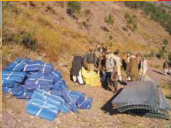
PATTAN Shelter Program - Patlung