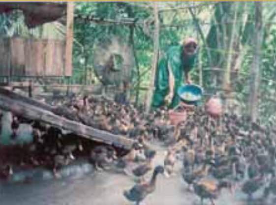
Promotion of high breed duck at domicile level