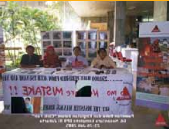
Civic Fair March 2005