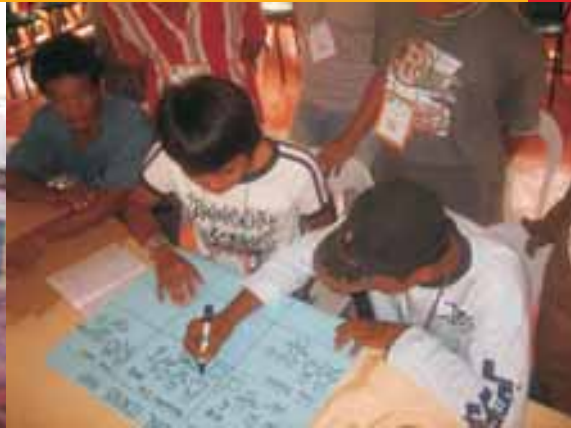
Data gathering for community development