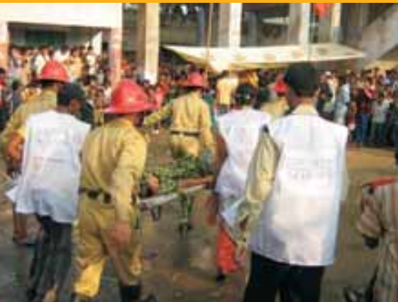
Mock demonstration with Fire Service and Civil Defense