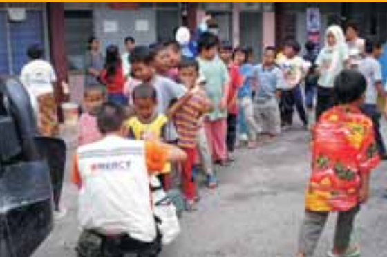
Johor Malaysia Flood Relief - Psychosocial Intervention