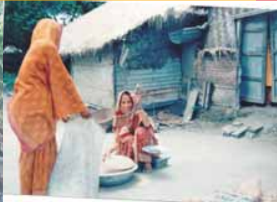
Women driven to surve IGA