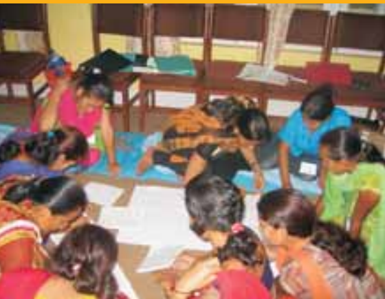
During the Womens leadership Training on DM (CBDM)