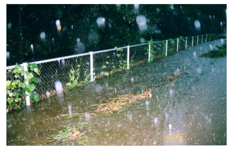
No.2 Flood flow in irrigation canals