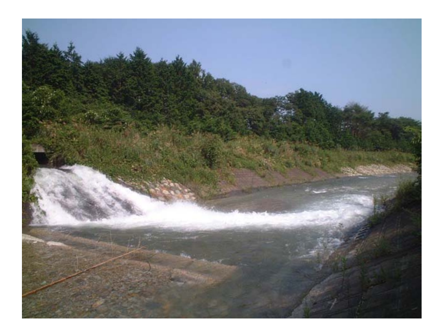
Photo.2 The irrigation canal systems supply fire extinguisher water

No.4 Supply from a wasteway of the Irrigation canal