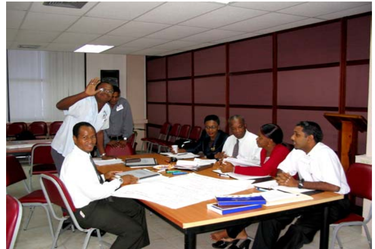
DMTP Disaster Risk Management Workshop, Georgetown, Guyana