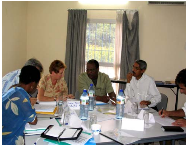
DMTP Contingency Planning Workshop, Nouakchott, Mauritania