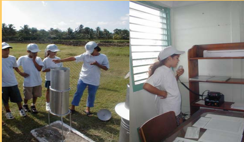
Early warning system