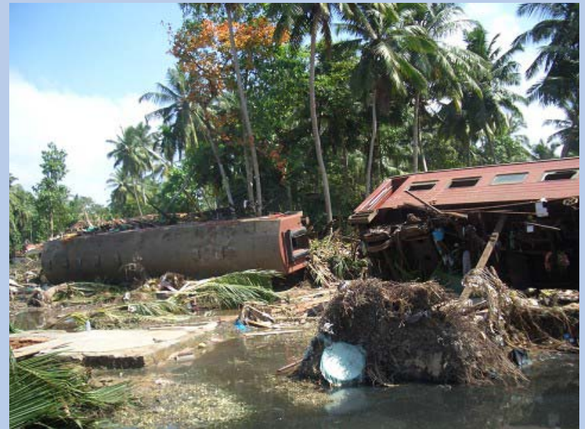
Hikkaduwa, Gall Province, Sri Lanka 11