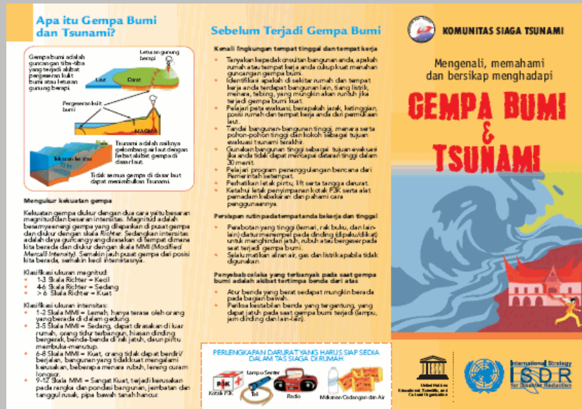
Figure 4: Leaflet on earthquake and tsunami