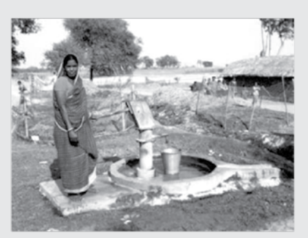
The ICICI Lombard and BASIX partnership project became the first weather insurance initiative in India and also the first farmer-level weather-indexed insurance offered in the developing world.

Agricultural productivity in India is at risk of severe losses from high temperatures, increased drought, and flooding which can cause large-scale crop failure as well as slower productivity losses due to soil degradation. More than two thirds of the Indian workforce relies on agriculture for their income, and weather patterns constitute a risk that needs to be effectively managed.