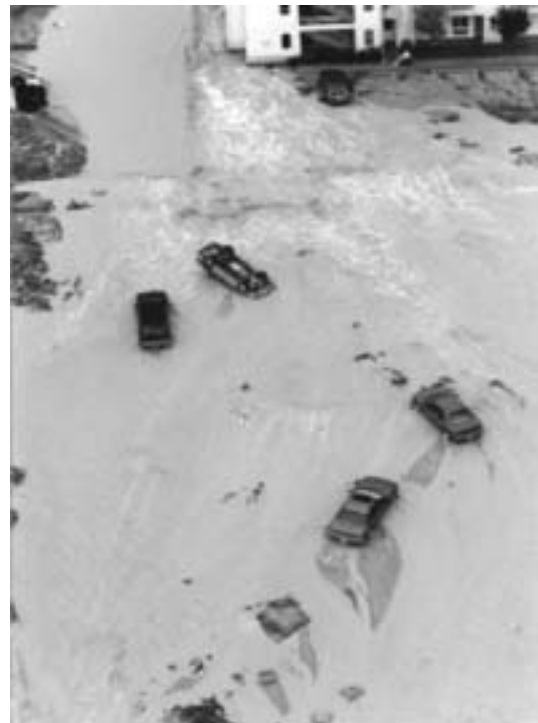
Las Vegas, July 1999, flash flood meets desert

Communities subject to flash flooding require warnings of meteorological conditions that, when combined with antecedent basin conditions, could lead to flooding. This represents a special case of flood forecasting and warning. The challenge in such cases is rapid depiction of critical flood thresholds and their subsequent communication and emergency response. An analysis of historical rainfall records, including storm transposition and the resulting streamflow would help to identify areas of concern.