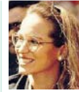
Princess Zahra Aga Khan Head of the Social Welfare Department, Secretariat of His Highness the Aga Khan