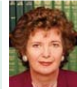
Her Excellency Mary Robinson

Princess Zahra Aga Khan, the eldest child of His Highness the Aga Khan, is the head of the Social Welfare Department of the Secretariat of His Highness at Aiglemont, in Gouvieux, France. She has policy and management responsibility for the health, education and planning and building services of the Aga Khan Development Network (AKDN), and holds a key role in policy and strategy for the Network's other social development institutions, including for the fifteen countries in which the Network operates. Princess Zahra is a member of the Board of Trustees of the Aga Khan University, and works with institutions supported by the Ismaili Muslim community in the areas of social welfare, women's activities and youth programmes.