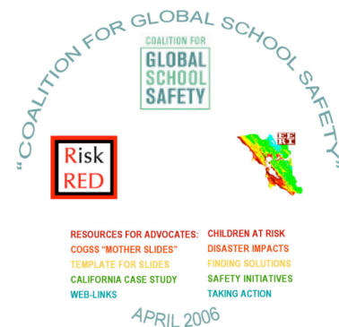
COGSS Advocated CD cover