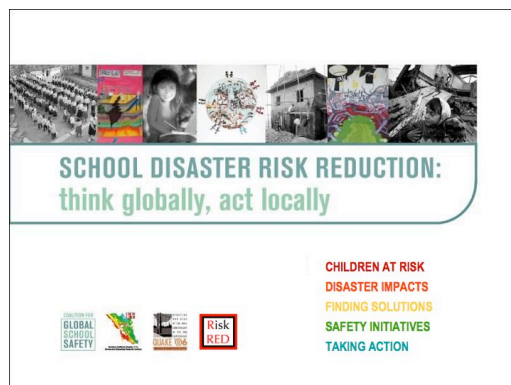
COGSS Mother Slide Show cover