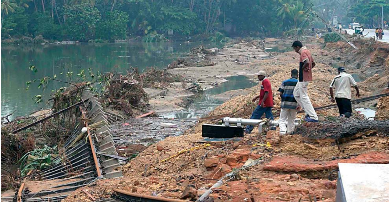
Railway tracks damaged by the great tsunami of 26 December 2004, Sri Lanka