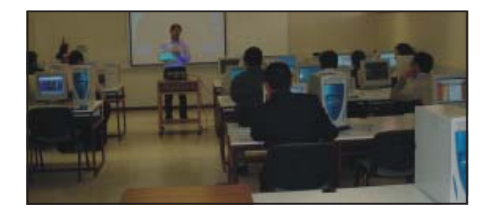
Training on the application of risk estimation tools to urban planning and sustainable development

In May 2003, UNESCO in collaboration with UN/ISDR launched the "Safer Cities Initiative" building on the experiences of the 1998-1999 RADIUS project (during the IDNDR) implemented in Antofagasta.