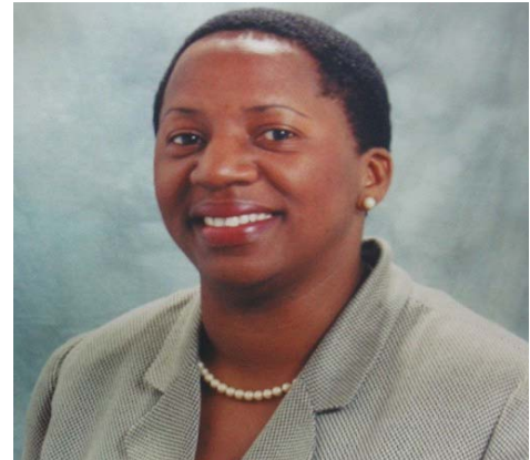
The Hon. Penelope Beckles Minister of Public Utilities and the Environment.